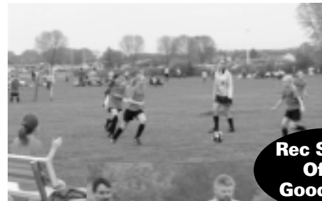
Rec Season Off to Good Start